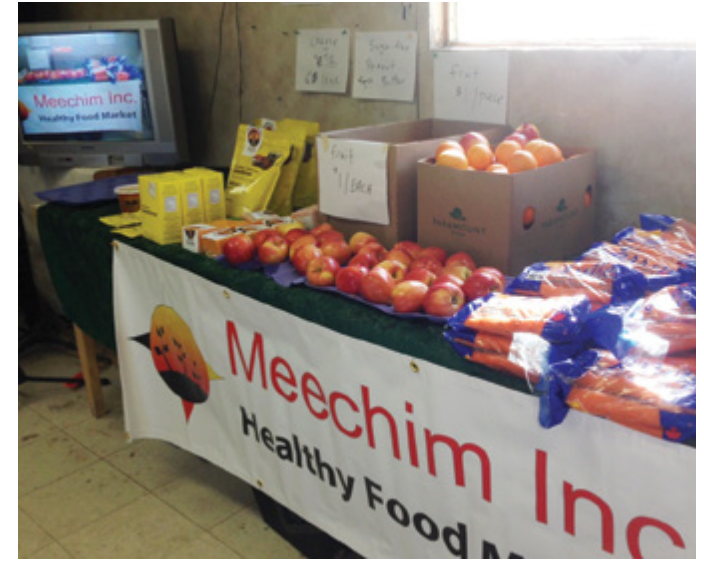
Fresh produce for sale in the Garden Hill TV station - one of the market's temporary locations.

Another challenge has been getting community members interested in purchasing the fresh and unprocessed foods that the market is selling. Many people are used to purchasing processed, convenient foods that are quick and easy to prepare, but not very healthy. The goal of the Meechim project is to direct the local food economy towards healthier alternatives, making a positive long term impact.