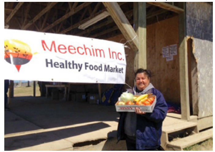
A Garden Hill resident shows off her market purchases.

Still, little by little, the Meechim project seems to be having an impact. One of the biggest successes of the market so far is that kids in the community are starting to spend money on healthy options like apples and bananas, instead of choosing chocolate and candies. It makes us feel proud and inspires us to keep working and improving the market.