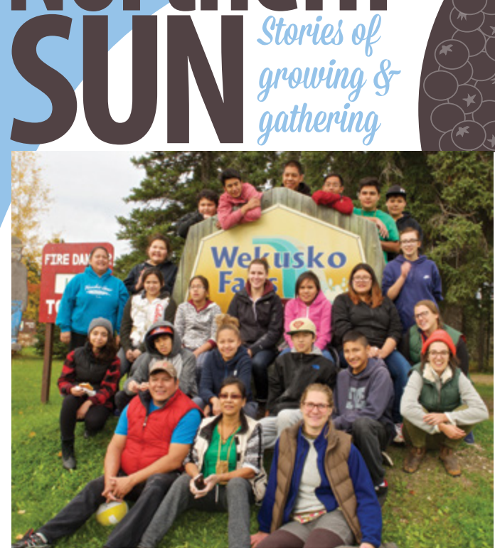
Participants, chaperones and Food Matters Manitoba staff at the beautiful Wekusko Falls park.