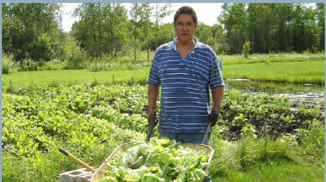
The community of Pinaymootang went from under 40 community gardens to having one in almost every home!