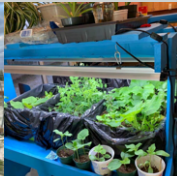
Providing grow lights for the Grand Rapids School Garden Club