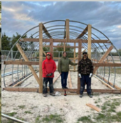
Building a greenhouse in Lac Brochet