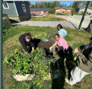
Building raised garden beds for elders in Fox Lake